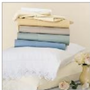
Lauren Ralph Lauren Estate Sateen Sheets