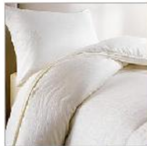
Lauren Ralph Lauren Regent White Goose Down Comforter