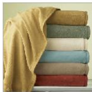
Martex Microfiber Ultrasoft Raschel Blanket