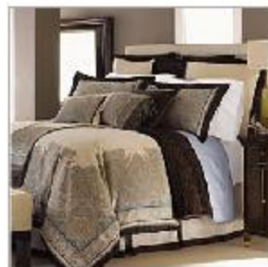
Charisma Orlando Bedding Collection