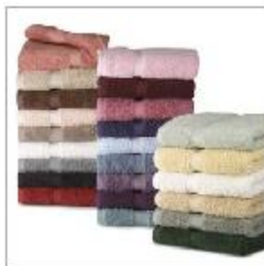
Grand Patrician Sensation Towels